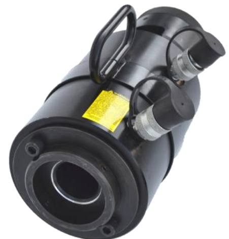
60 Ton Pulling Ram