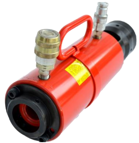
30 Ton Pulling Ram