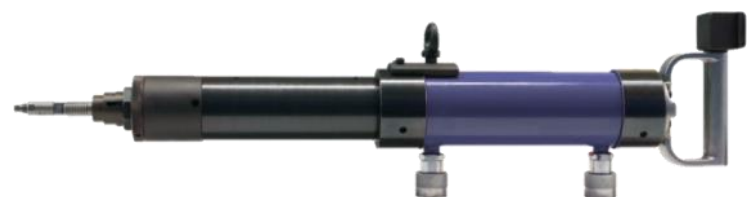
Stub Pulling Ram