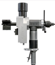
Pneumatic Mini Flange Facer