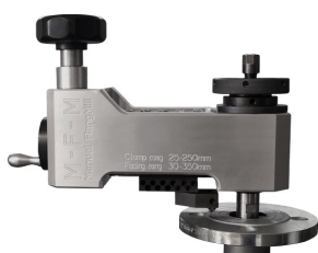
Manual Flange Facer

We can supply OD Mount, ID Mount and Hand-held options and various drives methods: pneumatic, electric, hydraulic and manual, are available.