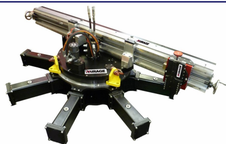
Internal Mounted Flange Facer

Please contact us with your specific requirements and we will be happy to recommend a suitable machine.